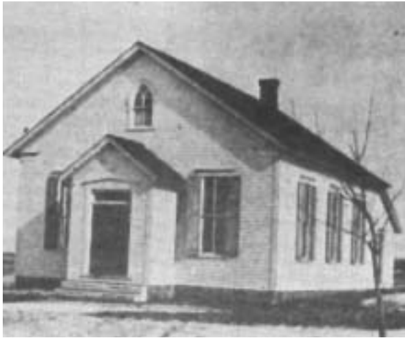
First Sunday Service, Nov. 3, 1888, in this new church building