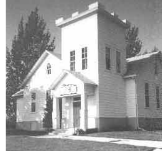
Present church building

Join us Sunday, November 2, 2008 to help us celebrate this unique milestone in our church's proud history! More information will be forthcoming. Send us your ideas and suggestions.